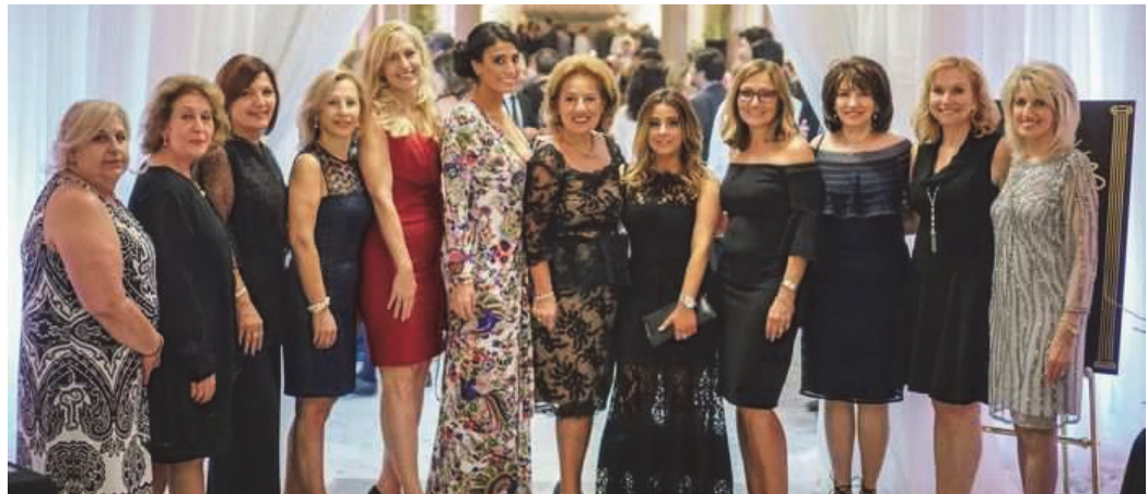
Committee members at the 2018 HLBS Ilios Gala