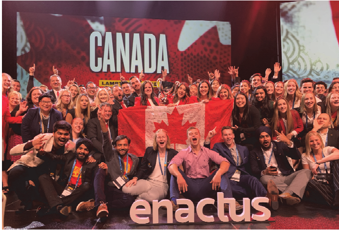
The winning team from Lambton College

As part of our 50th anniversary celebration, Pembroke is the presenting sponsor of the Alexander Calder Radical Inventor exhibition at the Montreal Museum of Fine Arts. The exhibit runs until February 24th, 2019.